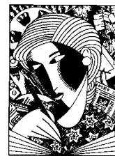
Vice President, Programs

Contact: 703-907-5707 (w); axd0@nreca.org